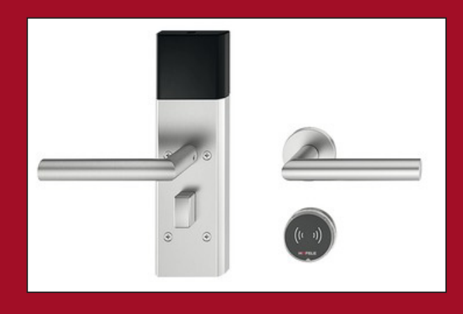
Dialock DT 710