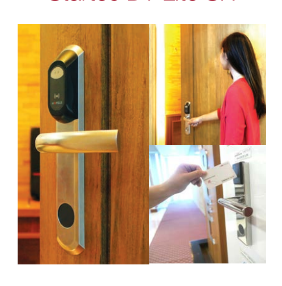
Startec DT Lite SR