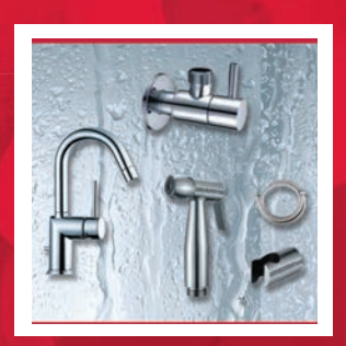
SANITARY FITTINGS AND ACCESSORIES