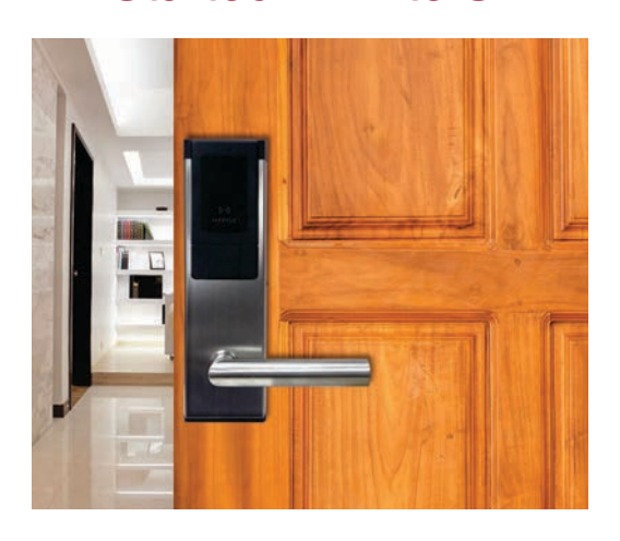
Startec DT Lite SE