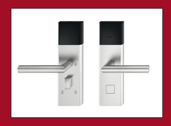
Dialock DT 700