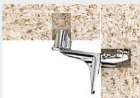
2) Fit shelf