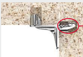
3) The weight of the shelf makes the arm lie flush against the side panel