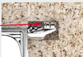
4) The twin grooves drill themselves into the wood. Greater stability is achieved